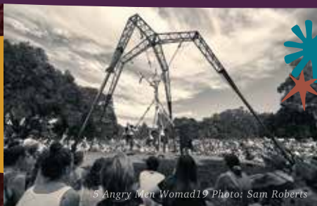
5 Angry Men Womad19

DATE Friday 27th May 2022 WHEN 5pm - 9pm WHERE Main Street